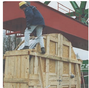
■ Assembly of the fully harnessed cable carrier system