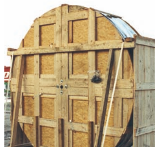
■ Fully harnessed cable carrier system in shipping crate