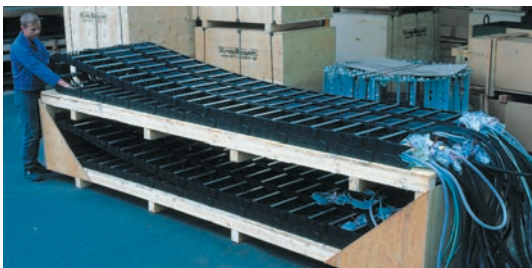
■ Ready-to-connect assembled plastic cable carrier system, packed ready for installation

We develop, design and supply all components required for your individual cable & hose carrier system.